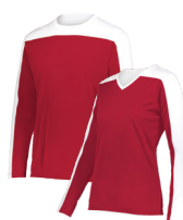
223502 223602 223702 Momentum Team Long Sleeve Tee