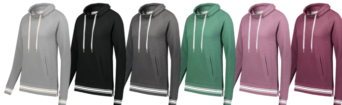
ATHLETIC GREY HEATHER/ BIRCH 982