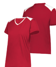
223501 223601 223701 Momentum Team Tee