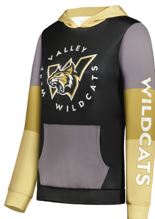
Color Block III