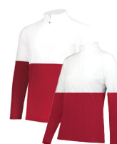
223500 223600 223700 Momentum Team 1/2 Zip Pullover