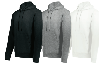
ONYX HEATHER 146