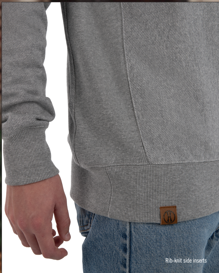
Rib-knit side inserts