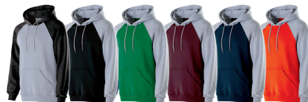
ATHLETIC HEATHER/ BLACK 158