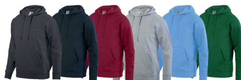
CARBON HEATHER 083 BLACK 080 CARDINAL J36 CHARCOAL HEATHER 017 COLUMBIA BLUE 089 DARK GREEN 035