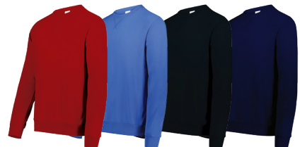
CHERRY RED 085