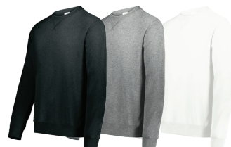
ONYX HEATHER 146