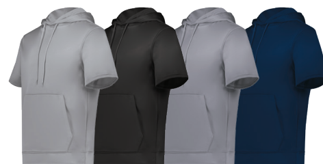
ATHLETIC GREY 009