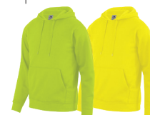
LIME 096 POWER YELLOW 810