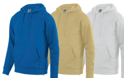
ROYAL 060 VEGAS GOLD 023 WHITE 005