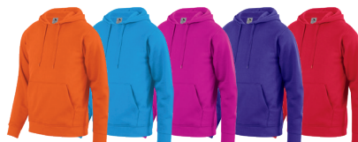
ORANGE 029 POWER BLUE 812 POWER PINK 809 PURPLE 050 RED 040