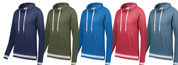
NAVY HEATHER/ WHITE 57N