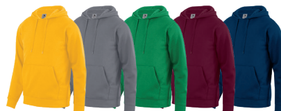
GOLD 025 GRAPHITE 059 KELLY 030 MAROON 045 NAVY 065